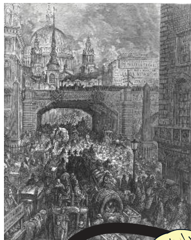
Ludgate Hill – A block in the street, by Gustave Doré (1872)